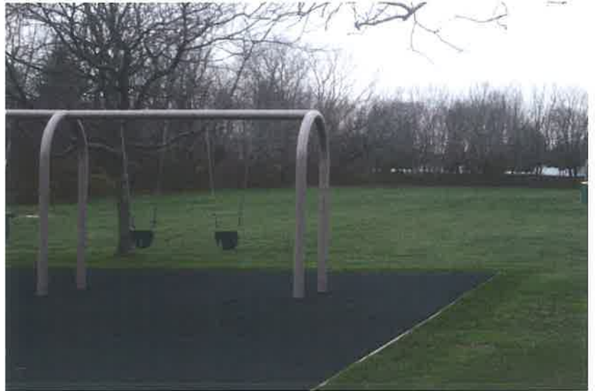
View of Tasker Park facing north