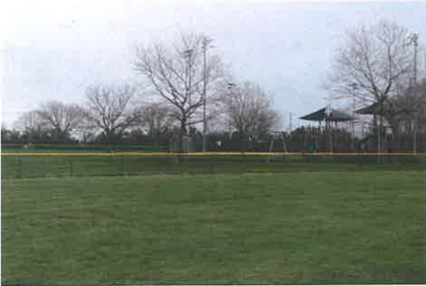
View of Tasker Park facing east