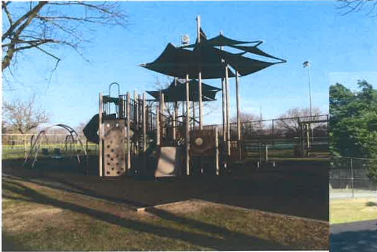
Tasker Park ADA Playground Completed Spring 2020