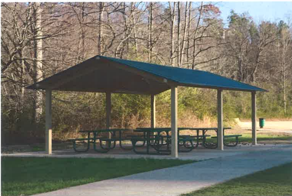
Orlando Model (Not Drawn to Scale)